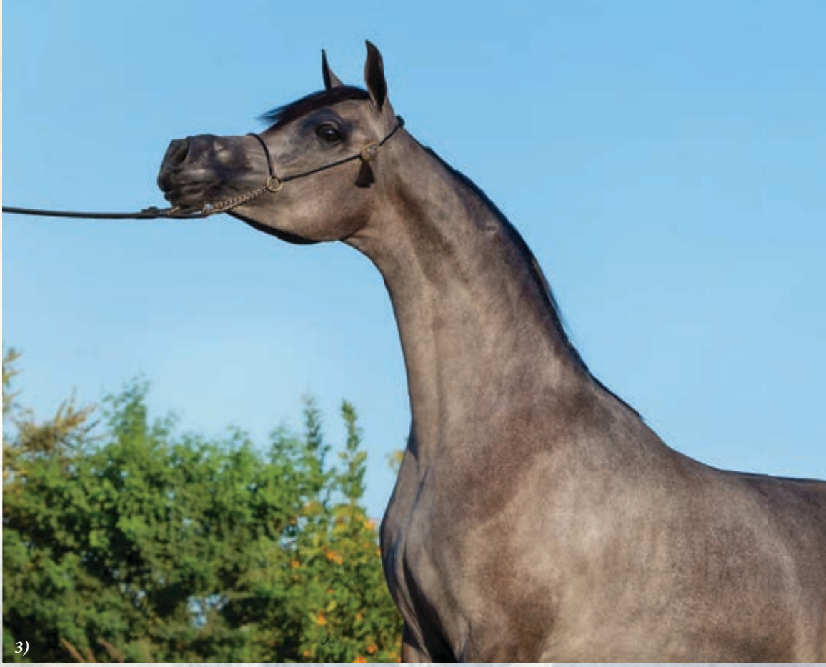
Arabian Horse Times | 34 | U.S.A. Breeders